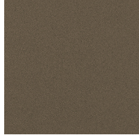
Ancient Bronze - 28