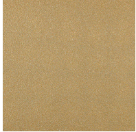
Jazz Gold - 29